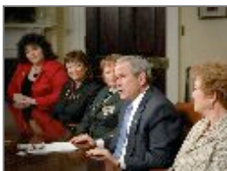
President Bush meets with representatives of "America Supports You" troop-support groups at the White House, Feb. 28. America Supports You is a Defense Department program that spotlights and facilitates support for the nation's servicemembers by the American public and the corporate sector. Download high res image