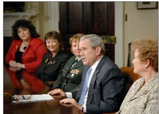
President Bush meets with representatives of "America Supports You" troop-support groups at the White House, Feb. 28. America Supports You is a Defense Department program that spotlights and facilitates support for the nation's servicemembers by the American public and the corporate sector.

The coalition is working with Walter Reed Army Medical Center here on a program that would offer military spouses part-time employment loved ones recover.