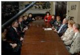
President Bush meets with representatives of "America Supports You" troop-support groups at the White House, Feb. 28. America Supports You is a Defense Department program that spotlights and facilitates support for the nation's servicemembers by the American public and the corporate sector. Download high res image