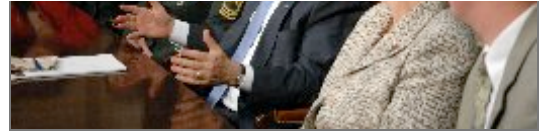
President Bush meets with representatives of "America Supports You" troop-support groups at the White House, Feb. 28. America Supports You is a Defense Department program that spotlights and facilitates support for the nation's servicemembers by the American public and the corporate sector.